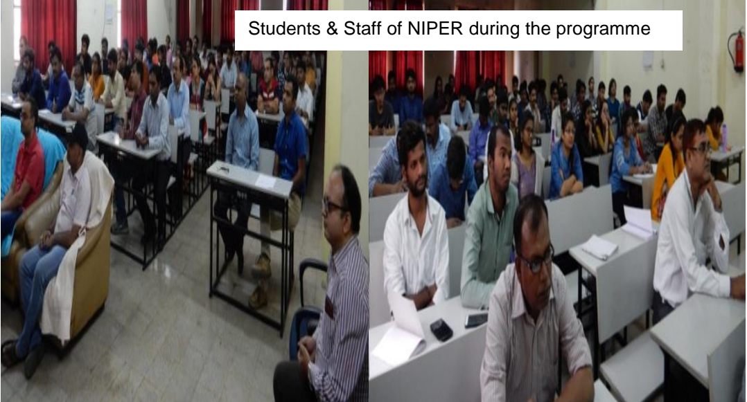
Students & Staff of NIPER during the programme